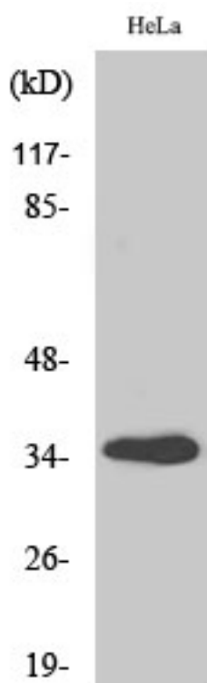
Western Blot analysis of various cells using GIMAP5 Polyclonal Antibody